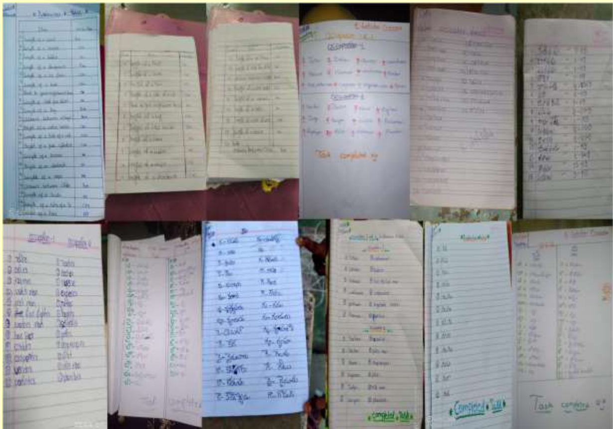
Completed tasks posted by students