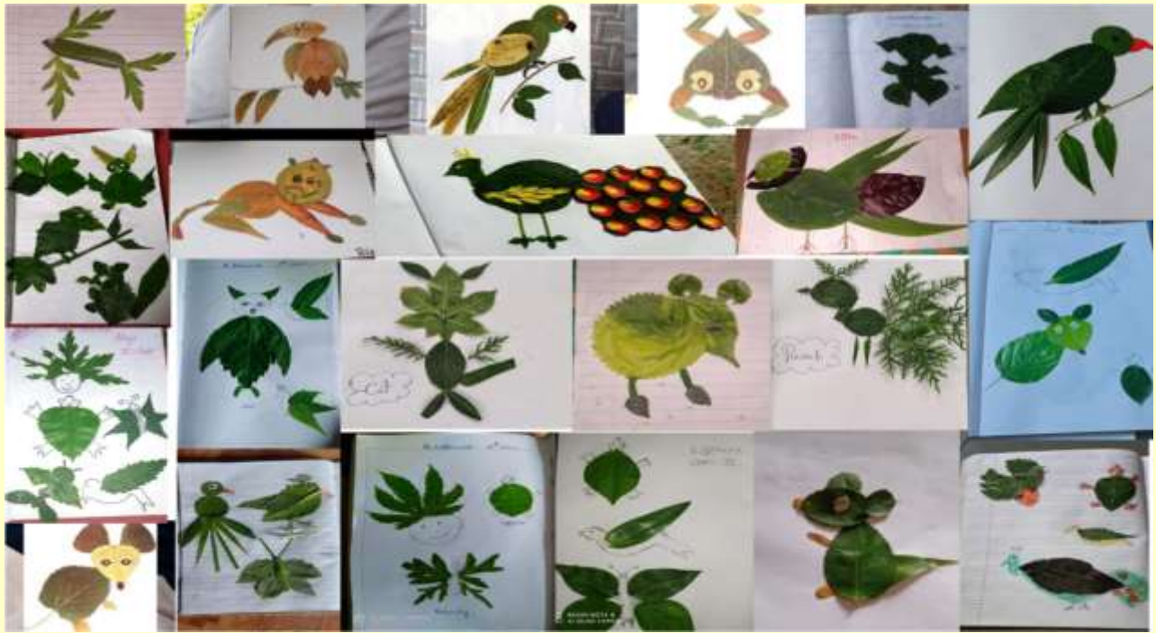
Collage of the leaf art done by the students