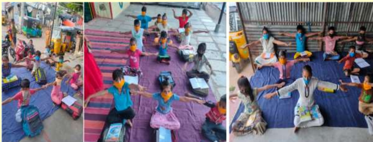
Students wearing masks and maintaining social distance in AVLCS