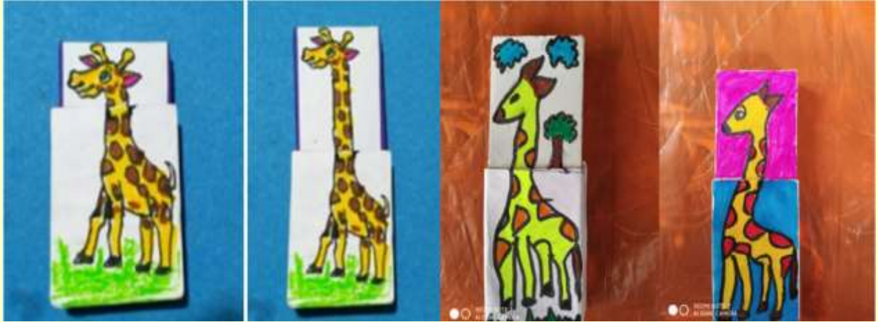
Giraffe on a match box activity by the students