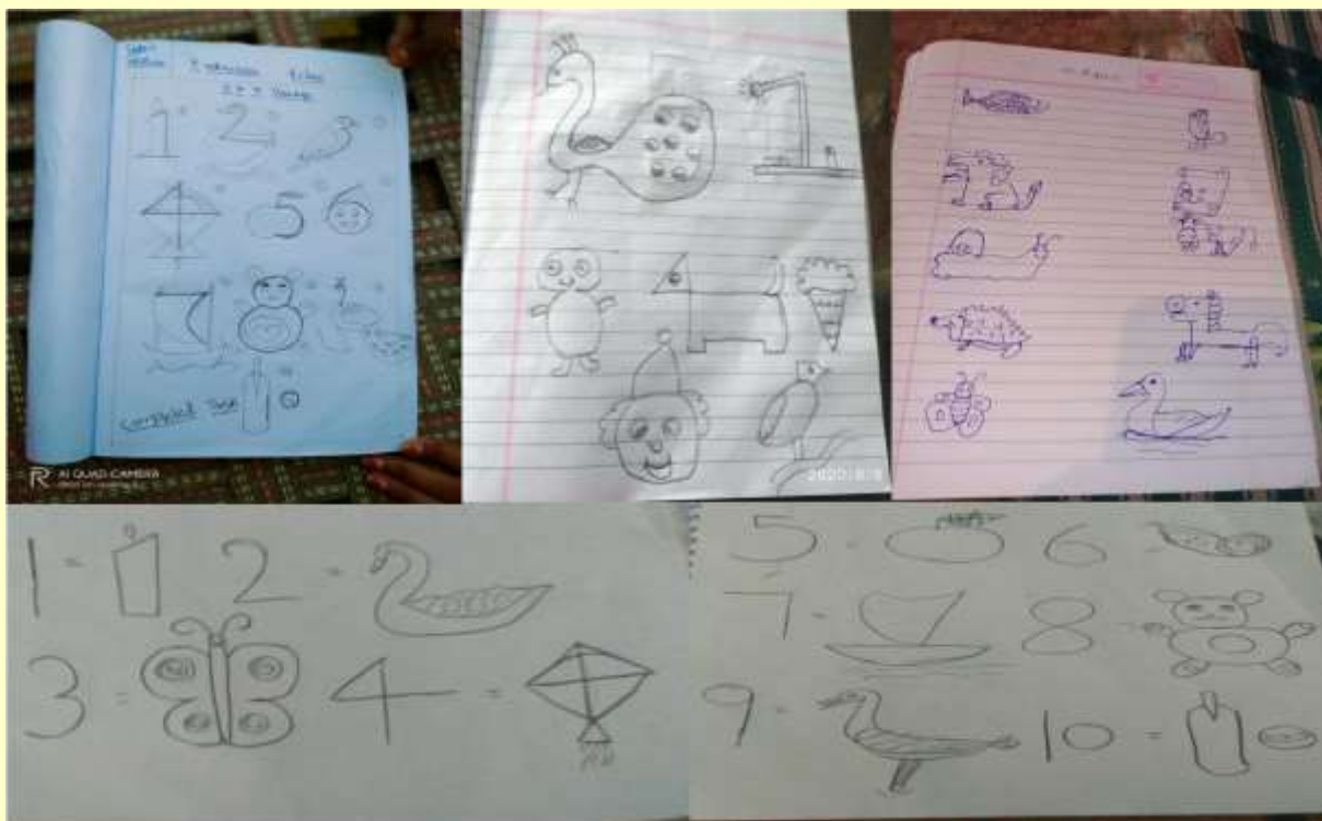
Number art posted by students