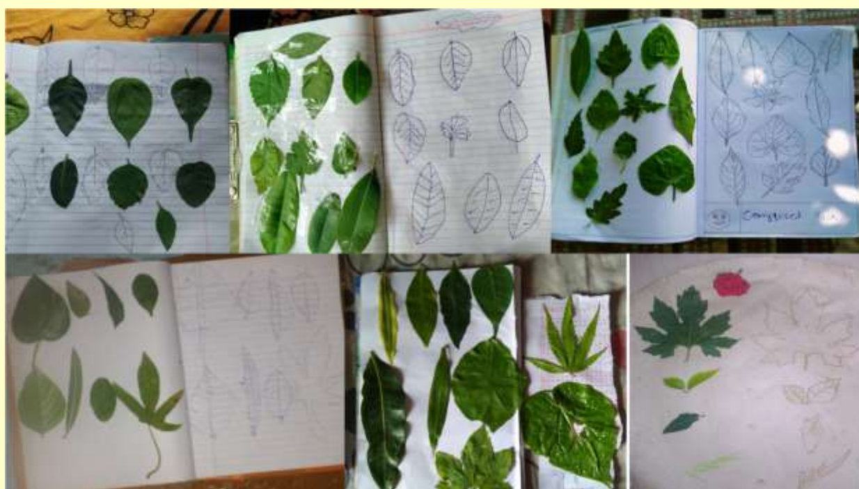
Different types of leaves pasted and drawn by students