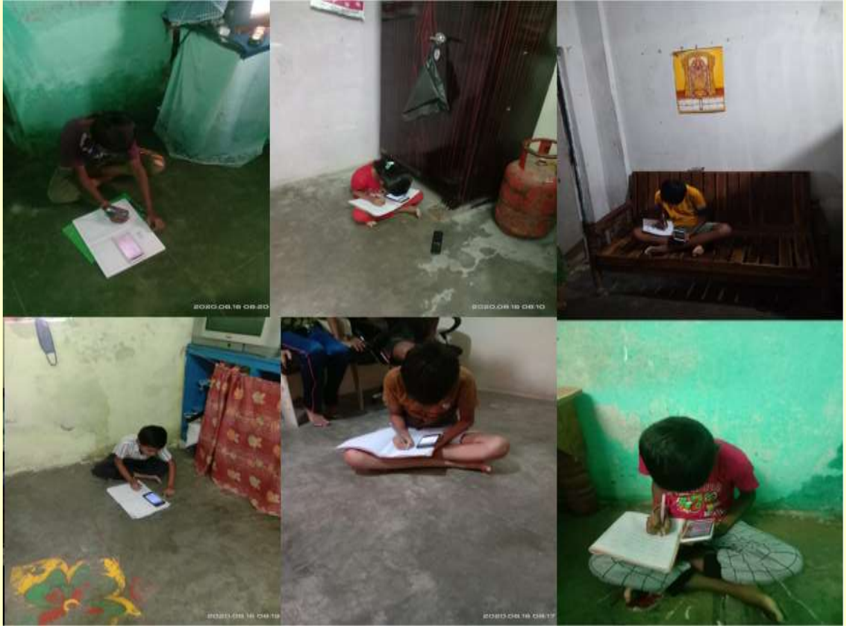
Students completing the tasks given in WhatsApp groups