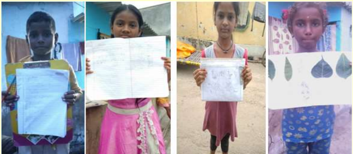
Students displaying the completed tasks